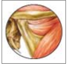
Figure 3: Anterior Meniscus Displacement