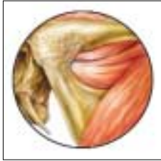
Figure 1: Ankylosis

There are symptoms that may indicate a TMJ has a problem. Those symptoms can include pain, clicking, or joint sounds, limited opening and radiographic evidence (x-rays, MRI, MRA, tomography, CT Scans, and/or a bone scan) of joint degeneration. Take time to discuss your individual diagnosis and any non-surgical options with your surgeon.