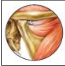
Figure 2: Degenerative Joint Disease (Osteoarthritis)